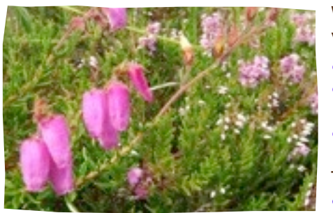
St Dabeoc's heath with ling

Following the Society's AGM on Sunday morning we will offer our guests a chance to explore Killary Harbour either