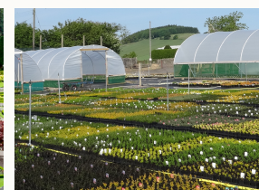
Perthshire Heathers at Cupar, Fife