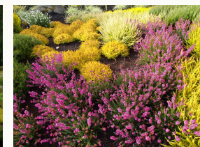
Heathers in Riverside Park