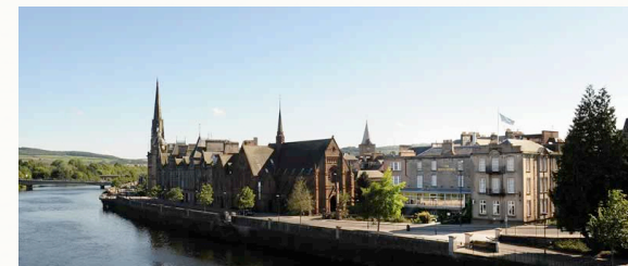
Royal George Hotel, Perth

is located on Tay Street in the heart of the city with stunning views over the River Tay. Queen Victoria stayed here in 1848! All rooms have en suite facilities, television, telephone, and tea- and coffee-making facilities. Some rooms have views over the hotel's award-winning gardens and the River Tay. There is limited parking, on a first come first served basis. The hotel is 15 minutes' walk from the railway station.