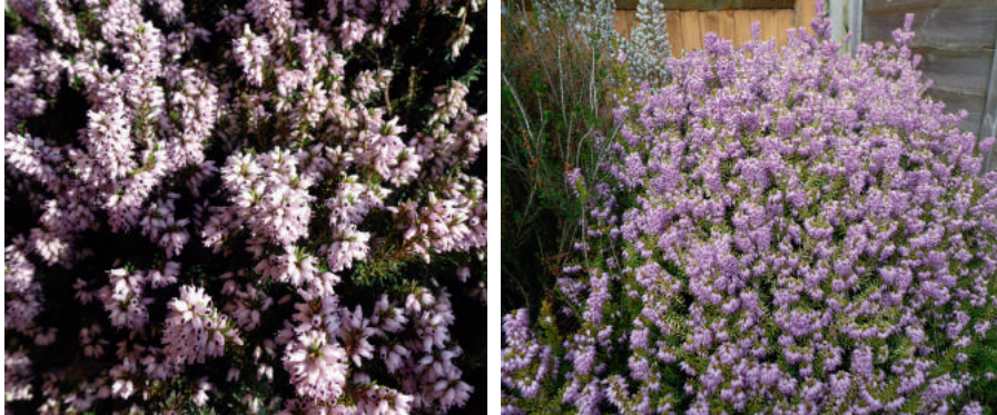
Figure 3. 'Thing Nee': 19 April 2015 Figure 4. 'Trish Silver': 19 April 2015 (photographed by R. Canovan). (photographed by R. Canovan).

Others I grow are 'Golden Jubilee' and 'Maxima': these are recent acquisitions so not fully tested but I trialled the former. Both are most promising. 'Ivory'