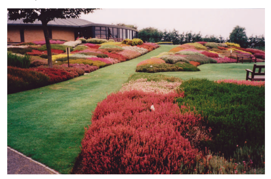
Figure 1. A nostalgic look back at a stunning heather garden, Cherrybank, Perth, about 1998.

I sense that such planting schemes have gone out of fashion of late, I certainly haven't seen any of the modern garden designers take up the theme at Chelsea, Gardening Scotland, et cetera. Yet, if we are to believe that gardens are getting smaller and people are getting busier, looking for low-maintenance plantings, surely the formula fits the bill? I would be the first to agree that a pukka rock garden might be even more attractive and intriguing but for the moment, let's concentrate on heaths and heathers.