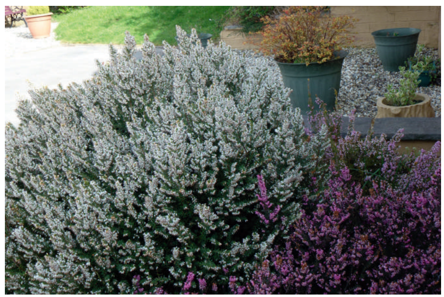
Figure 2. 'Irish Salmon' (right) sheltered by 'Brian Proudley', 19 April 2015; note they are in shade in this late afternoon picture.

Despite that, the heaths flower profusely; 'Irish Salmon' had flowered for over five months. Clearly 'Brian Proudley' is one of the hardiest cultivars. Also in that bed is 'Rosea' which exhibits very red foliage in cold weather (notably in 2010) but with little defoliation.