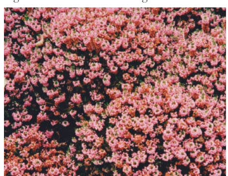
Figure 4. Erica vagans 'Mrs Donaldson'.