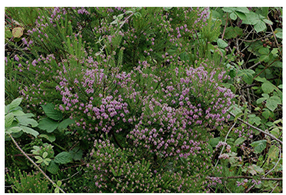
Figure 1. Erica terminalis, Corsican heath, in Warwickshire.