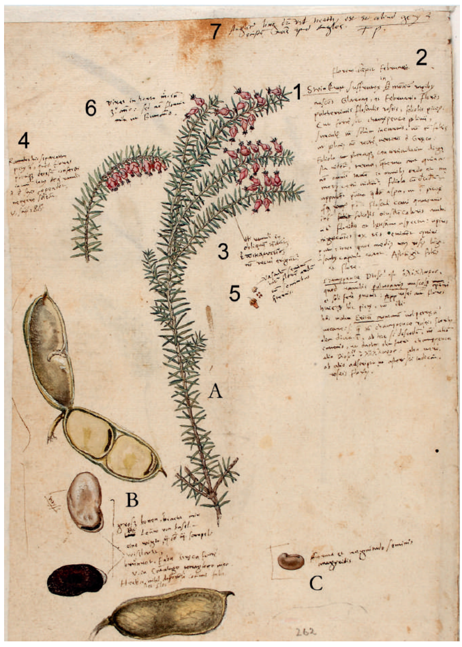
Figure 1. Conrad Gessner's drawing of Erica carnea (A), with broad beans, Vicia faba (B) and (C) another seed (Leguminosae). For transcripts of numbered annotations, see opposite.