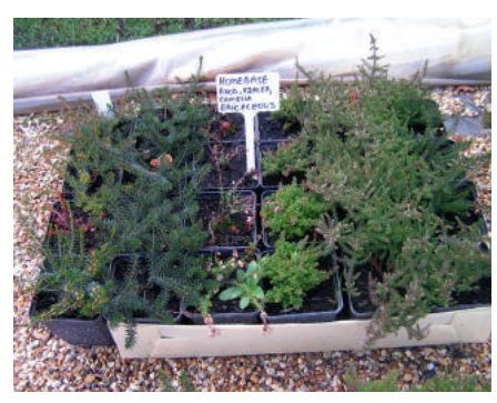
Homebase Rhododendron ... compost