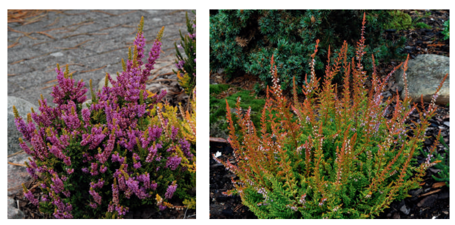
Figures 2 and 3. 'Eko' (left) and 'Tegel' (right): Borje Sorensson's small-leaved Calluna seedlings.

On the other hand, my 2013 sowing of open-pollinated seeds from Erica tetralix (cross-leaved heath) resulted in many plants with coloured foliage and shoot tips. Most of them revert to plain green, but some keep their yellow variegated foliage and new growth. I will continue to sow seeds, collecting from the new plants. There is no end when you work with heathers!