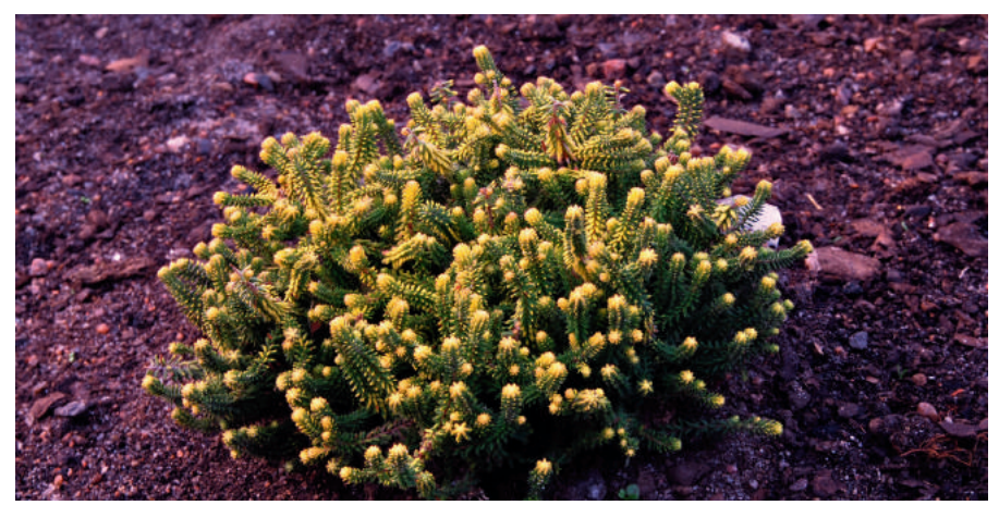
Figure 4. Unnamed seedling of Erica tetralix.

On the other hand, my 2013 sowing of open-pollinated seeds from Erica tetralix (cross-leaved heath) resulted in many plants with coloured foliage and shoot tips. Most of them revert to plain green, but some keep their yellow variegated foliage and new growth. I will continue to sow seeds, collecting from the new plants. There is no end when you work with heathers!