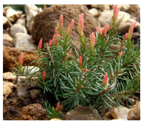
Figure 2. Young plant, in Outwell, of E. × factitia 'Johannes van Leuven' showing coloured young shoots.