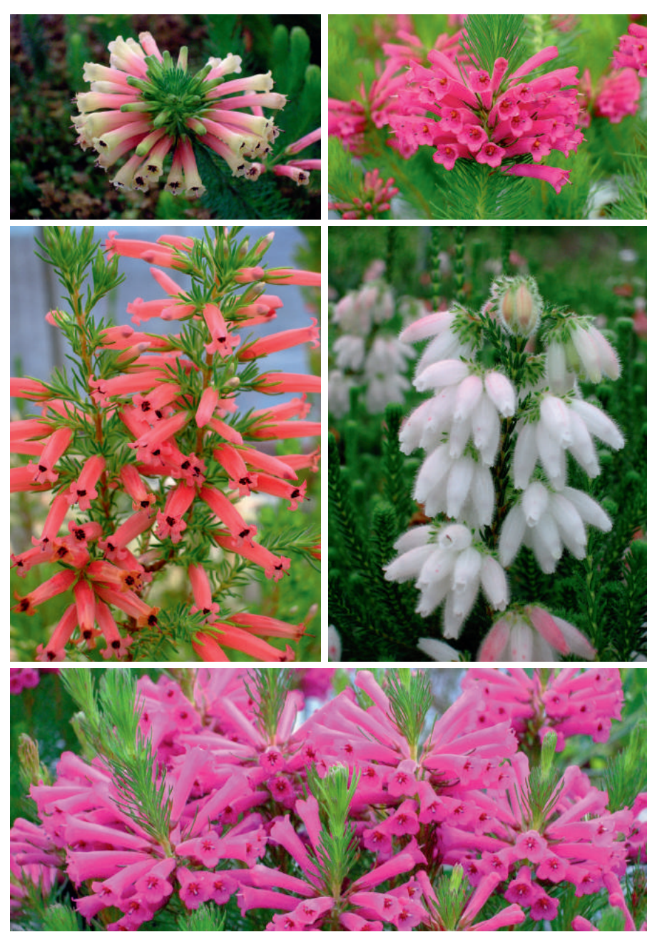
Japanese "fireworks": new seedlings of Cape heaths by Takayuki Kobayashi (see p. 74)