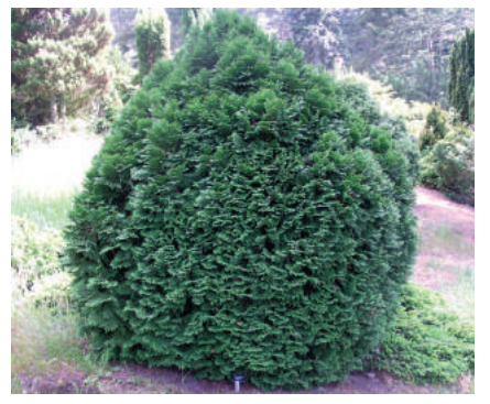
Figure 5. Chamaecyparis lawsoniana 'Minima'.

There is only one way to avoid being duped, albeit unintentionally, and that is to do your homework. You cannot always believe what you read on the label. I recently saw a young three-year-old golden Lawson cypress, about 60cm described as a dwarf conifer and I know that it will grow to at least 5m high!