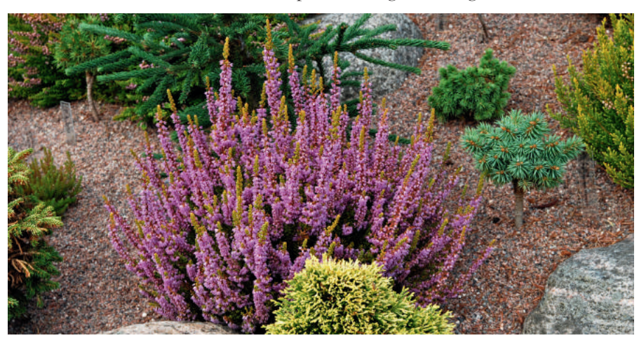
Figure 1. Calluna vulgaris 'Troy', one of Börje Sörensson's small-leaved seedlings named by Ann-Marie and Sonny Magnusson after their dog.

Many of my seedling plants have extremely small leaves (they might be termed "Microphylla"). At first seeds from C. vulgaris 'Peggy' gave no plants of value, but later on some small-leaved plants appeared in the seed bed. Funny, because 'Peggy' has rather coarse foliage. This kind of Calluna may not be commercial, but they fit very well in small gardens and rock gardens. It would be nice, to have a collection of these plants with good foliage and flower colour!