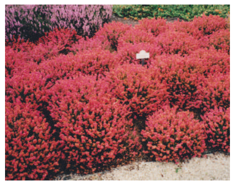
Figure 3. Erica cinerea 'Atrosanguinea'.