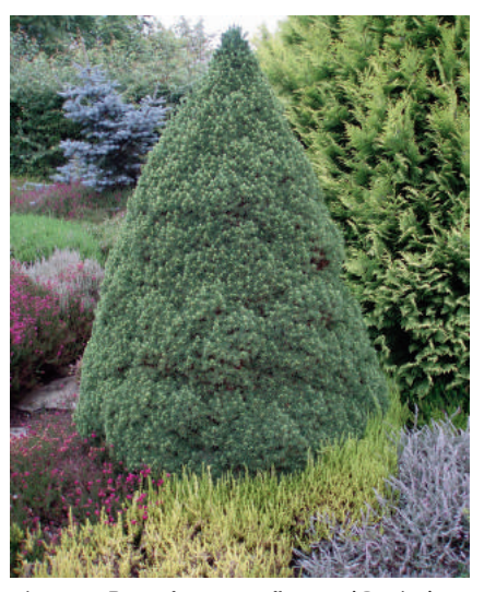
Figure 6. Picea glauca var. albertiana 'Conica'.

Your research may be a little timeconsuming and bothersome because some of these little beauties have very long unwieldy names. Prepare your plan and I reckon you will finish up with one or two of the following.