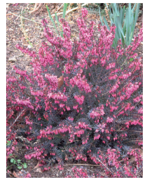
E. cinerea 'Creepy Crawly'