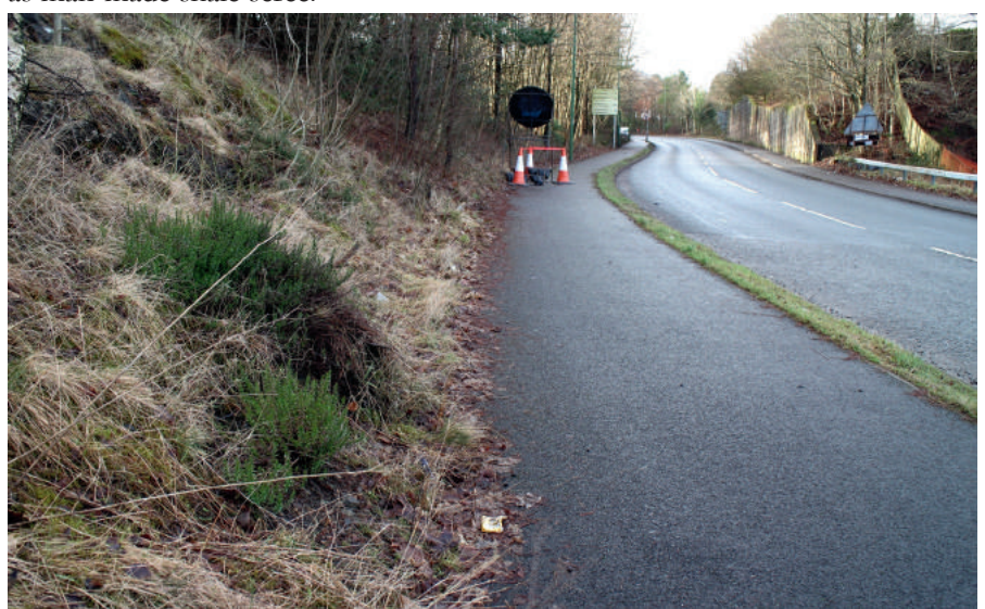
Figure 1. Habitat of the naturalized St Dabeoc's heath (Barry Stewart).

It was the County Recorder responsible for West Glamorgan (vice-county 41*), Barry Stewart, who first spotted this on 1 February 2015. The site is next to a busy road in Brynmawr – a market town in Blaenau Gwent, South Wales, sometimes claimed as the highest town in Wales at 1,250ft to 1,500ft above sea level. The landscape of the whole area is affected by the former Nantyglo Ironworks and the ground at the edge of the road in question could be described as man-made shale scree.