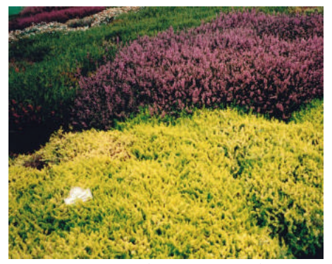
Figure 2. Erica carnea 'Golden Starlight'.