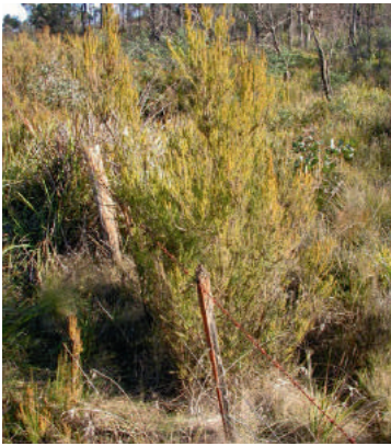
Figures 3 and 4. Besom heath ( Erica scoparia ), first recorded in Tasmania in 1983, has since infested hundreds of hectares.

There are good reasons for Tasmania to be concerned about the arrival of new weedy Erica species. The more Erica species present in one location, the greater the potential implications. Certain species have the capacity to invade in situations where other Erica species may not. For example, E. tetralix (crossleaved heath) has an outstanding capacity to grow in waterlogged situations. In its natural environment it will grow in habitats that are too wet for most other Erica species (Nelson and Coker 1974). Likewise, yet another European species E. cinerea will out-compete related species in dry conditions and on mineral