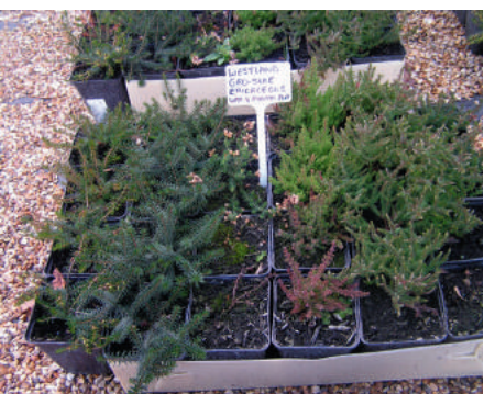
Westland Gro-sure Ericaceous