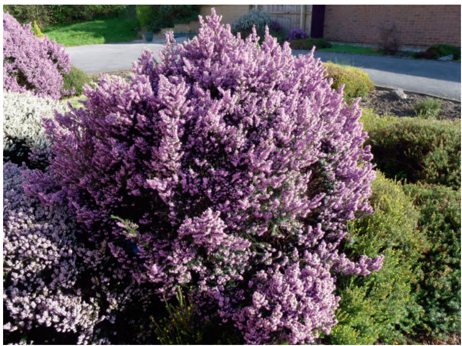
Figure 1. Erica erigena cultivars thriving 2015, in the "rain garden" created by the gentle slope, with 'Rosslare' (main plant), 'Irish Silver' (left), 'W. T. Rackliff' and the giant 'Glauca' beyond.

For a number of reasons Erica erigena (Irish heath, long known as Mediterranean heath) cultivars are rarely seen today in garden centres or even heather nurseries. One of these is their supposed tenderness. However, in my experience, they are remarkably hardy even in severe weather and the species is perhaps getting the blame for a failure of the trade. I am usually associated with growing E. vagans (Cornish heath) and its hybrids, and some of the more unusual heaths, but the species I probably have most experience of is E. erigena . The cultivars have provided many of my most outstanding plants with fantastic bloom.