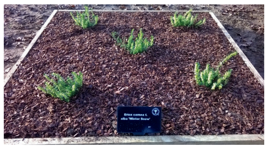
Figure 4. One of the 1 × 1m raised beds at Whitehall Nursery.

reliably in the garden. The AGM logo is used throughout the horticultural trade, by nurseries, garden centres and online plant and seed suppliers, as well as in catalogues, books and magazines. To achieve the AGM a plant must be