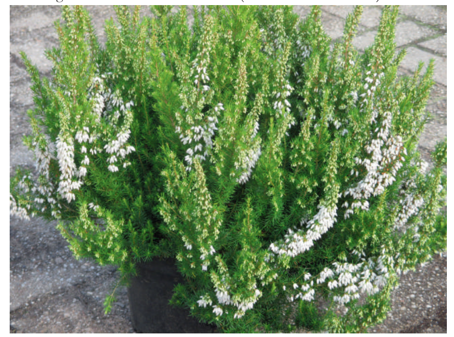
Figure 1. Young pot-grown plant of E. \times factitia 'Johannes van Leuven'.

The natural geographic ranges of Erica lusitanica Rudolphi (Portuguese heath) and E. carnea L. (winter, or mountain heath) do not overlap so there can be no wild-origin, natural hybrids. While both species have long been cultivated, at least in gardens in Britain, there are also no reports from gardeners of any spontaneous hybrids between these species even though each has produced such hybrids with other species (Nelson 1999, 2011: Table 2, p. 4). For example, E. × darleyensis Bean (Darley Dale heath) arose when the two rather similar winter- to spring-blooming heathers E carnea and E. erigena R. Ross (Irish heath) crossed in gardens (Nelson 2011: 316–319), and, likewise, E × veitchii Hort. R. T. Veitch ex Bean (Veitch's heath) is the offspring of E. arborea L. (tree heather) and the again rather similar E. lusitanica (Nelson 2011: 322–326). In the later