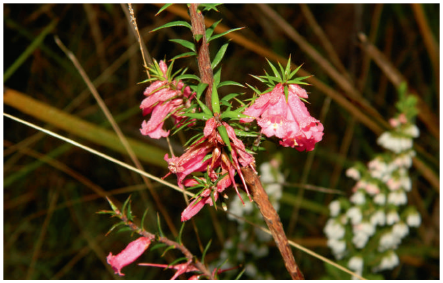
Figure 2. Native Epacris impressa with the invasive Portuguese heath ( Erica lusitanica ) in the background.

Now widespread in Tasmania, Erica lusitanica typically first appears in new areas along sections of road. Its fine seed is readily transported by vehicles. From the roadside it easily advances into native vegetation or unimproved pastures. E. lusitanica often invades native vegetation where the native heath Epacris impressa grows. I recently photographed the two flowering together. It is a pretty picture (Figure 2) until you realize that one species is on a rapid advance in a place where it is not meant to be.