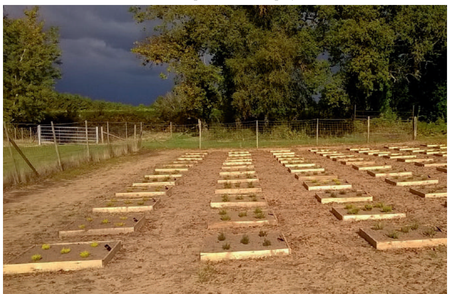
Figure 3. Whitehall Nursery trial beds.

Threave Gardens planted up the heathers across two island beds, on an open, sloping elevated site. The soil is shallow clay with pH 5.5, on rock bed. Erica cultivars were successfully grown here previously. Varieties have been planted depending on flower and foliage colour, eventual height and spread, habit, etc., as this will remain as a permanent display.