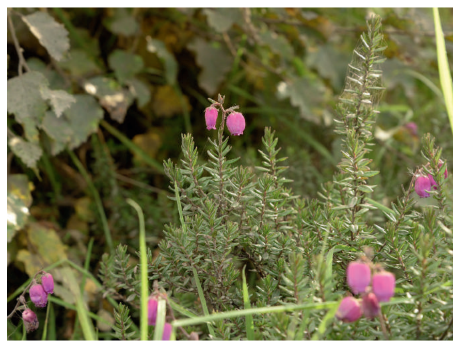
Figure 2. St Dabeoc's heath in bloom, October 2015 (John Crellin).

We have no way of knowing how they got there – no gardens are particularly near and deliberate planting seems unlikely; but the traffic in the area is busy with many HGVs some of which will have travelled from Ireland via the Fishguard–Rosslare ferry. The site is just off a roundabout that is on the main "Heads of the Valley" road along the southern edge of the Brecon Beacons and is now protected by a fence erected by contractors upgrading the road. It is hoped that the area where plants grow will not be directly affected by this work.