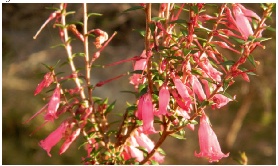
Figure 1. Australian native common heath ( Epacris impressa ) grows naturally through much of Tasmania.

Tasmania, Australia's most southern and only island state has a climate and topography similar to parts of Great Britain and Ireland. However, Australia's flora is very different to that of other continents. Heathers and heaths familiar in Europe, western Asia and Africa – particularly Erica and Calluna species – do not naturally occur in Australia. So it is no wonder with their natural beauty and the European heritage of many Australians, we chose to import these plants for our gardens. Having said this, Australia does have native plant nurseries and Australians have a significant love of native plant species. Australia also has its own heaths. For example, there is common heath ( Epacris impressa ) from southeastern Australia (Figure 1). However, the mainstream nursery trade has a strong focus on exotic species. Unfortunately, a percentage of these exotics (including some Erica species and Calluna ) become environmental and agricultural weeds.