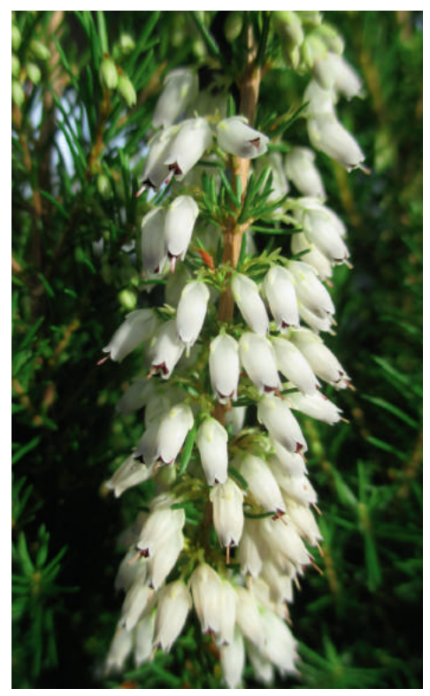
Figure 3. E. × factitia 'Johannes van Leuven'.

In December 2010, van Leuven cross-pollinated an unnamed seedling of Erica Iusitanica with pollen from E. carnea 'Winterrubin'. Of the resulting seedlings, two clones are still in cultivation (here designated nos 2010-1 and 2010-2) Only no. 2010-2 has been propagated; cuttings roots very easily (J. van Leuven, pers. comm., December 2014). Two years later, van Leuven repeated this interspecies cross using pollen from E. carnea 'Winterfreude'. At present, he has ten clones from these seedlings (herbarium voucher specimens in WSY: