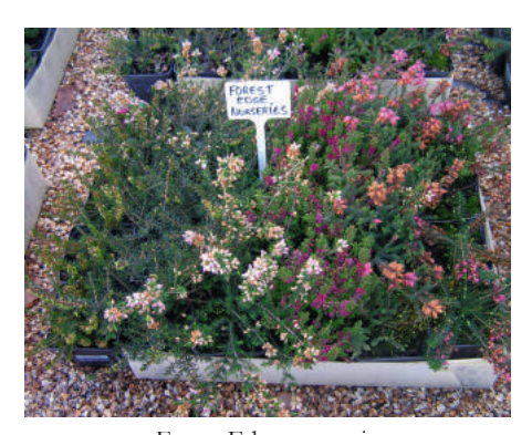
Forest Edge own-mix