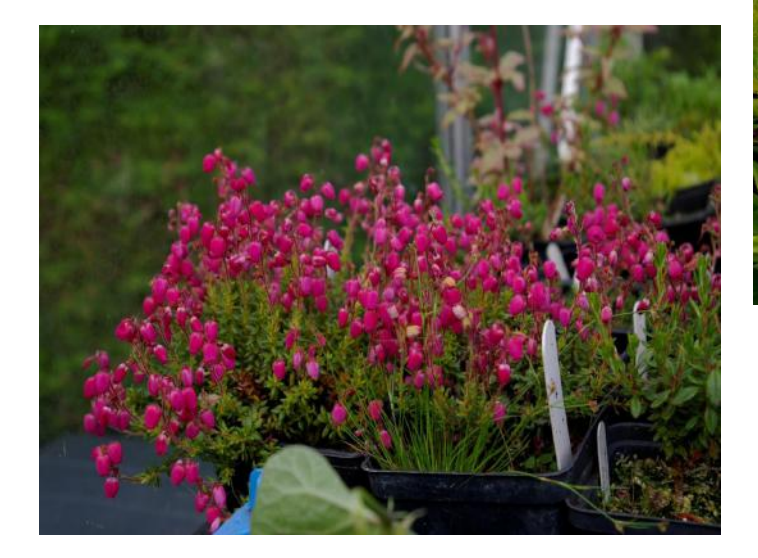
Above Daboecia azorica 'Don Richards'

The plant is slow growing and very compact, never reaching more than about 15cm in height, and is very floriferous. Like all true azoricas it only flowers for a single period in the year, namely May to early June, and as such is useful for bridging the heather gap between late spring and early summer. The flowers are bright pink and completely cover the plant. It is relatively easy to grow outdoors in full sun or partial shade, but does prefer the protection of a rock, or of other plants, provided these are not too vigorous. Because of its rather dainty disposition it is ideally suited to growing in a container or trough. The illustration shows some of my second year potted plants that flowered profusely in late May earlier this year.