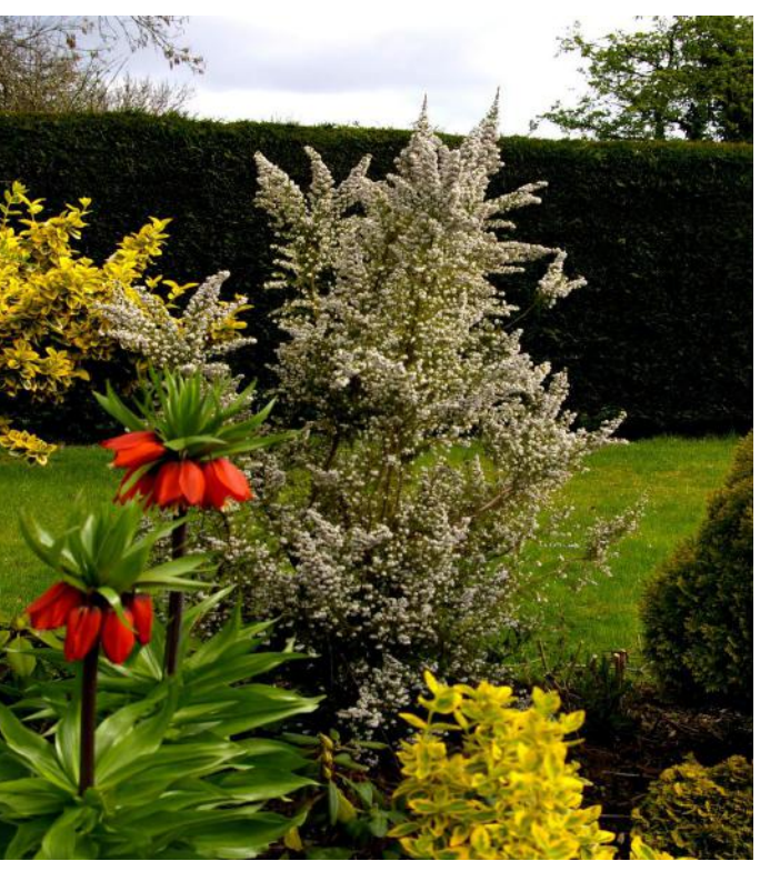
Below Erica x veitchii 'Exeter'

It is one of my favourites because it is so reliabaly floriferous, giving plumes of white flowers over several weeks from March-May, which have the added advantage of providing a delightful perfume. The height, which is easily controlled by judicious pruning after flowering, makes it ideal for planting as a specimen at the back of a mixed border, and provides a perfect foil for smaller spring flowering plants. Such a use is ilustrated in the picture below, which was taken in mid-March this year. I have also found it to be an ideal plant for providing an informal hedge by planting it in groups.