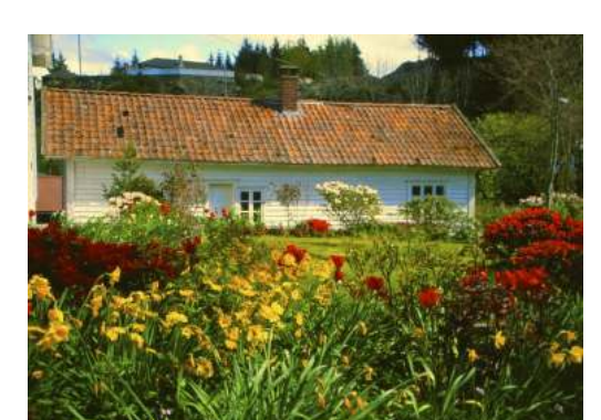
We hope to see some guests from the other side of the North Sea some day! Best regards