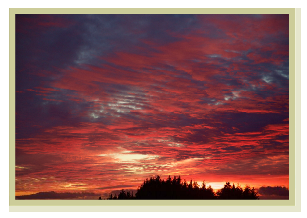
Sunset by Egil Sæle