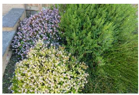
Erica carnea 'Vivelli' replaces the weeds!